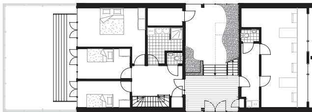
GROUND LEVEL, LIVING AREA 72.5M 2 , OFFICE 44.8M 2

The entrance to CHIBB is an atrium, which provides access to the living area, the office and roof garden. The spacious hall gives access to the bathroom, toilet, bedrooms and living space on the first storey. All rooms face the south-oriented garden and the roof garden. The greenhouse functions as an open roof, resulting in an exceptionally comfortable living environment.