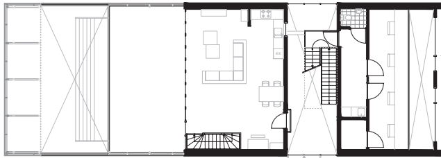
1 ST FLOOR, LIVING AREA 47.2M 2 , OFFICE 32.6M 2